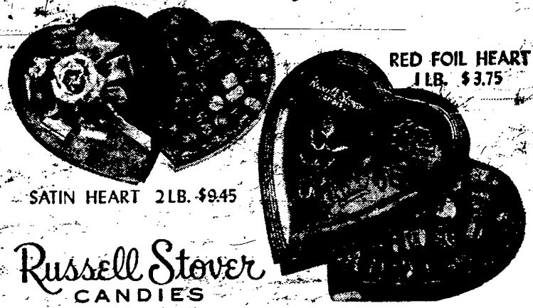
RED FOIL HEART 1 LB. $3.75