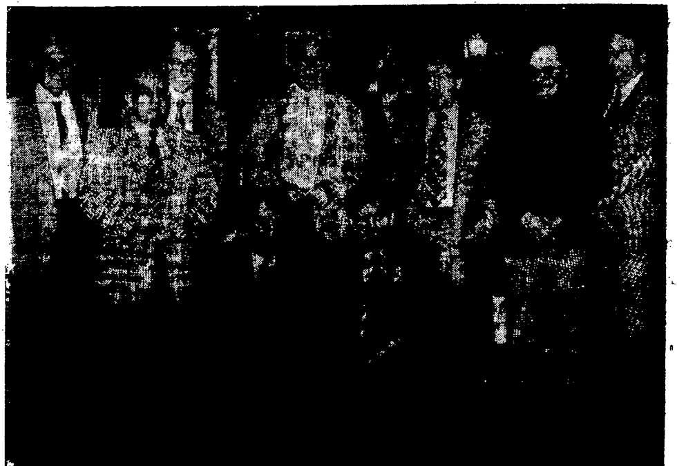
Ten Andover Lions Club Members receive Membership Awards at the Annual Celebration held recently at the "Coach-Light" Inn in Hornell, New York.