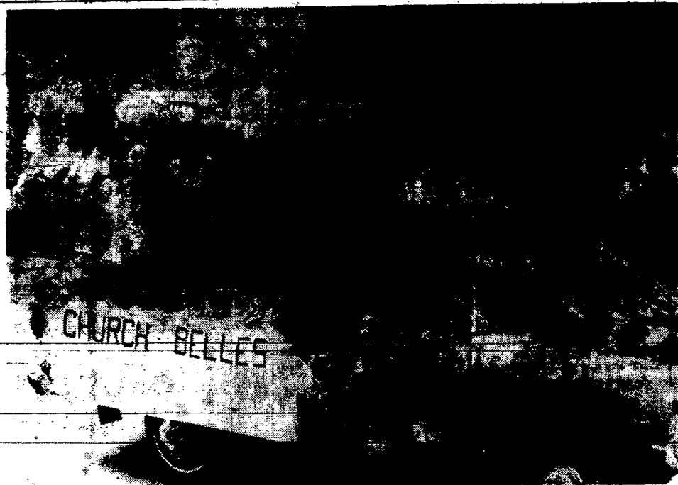
The "Church Belles" float that won First Prize in the Church Category in the recent (Sesqui)