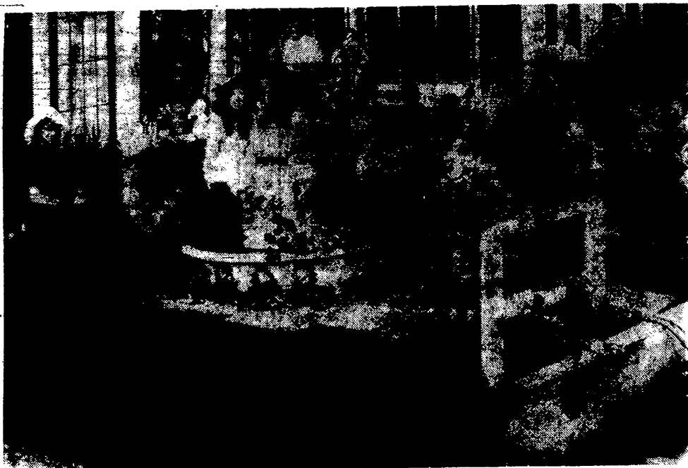
The Keystone Short-Shankers float that won Second Prize in the Commercial Category.