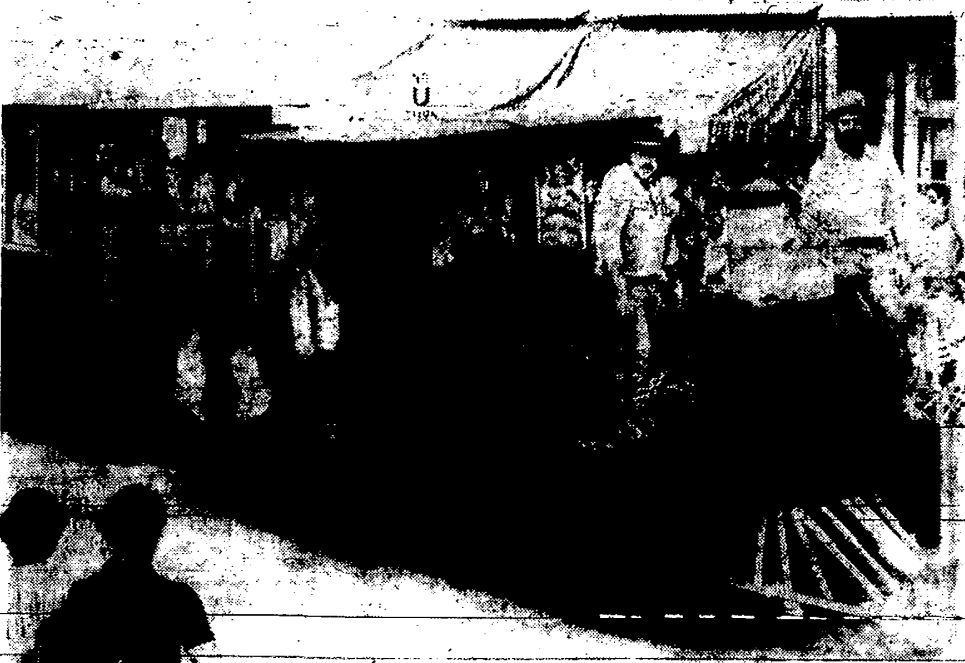
The Hustlers and Hustler Belles Chapters of the First Place Trophy in the Class for "Originality" in Andover's Sesqui-Centennial Parade on August 17th, 1974 with their old-fashioned Locomotive and Passenger Car.