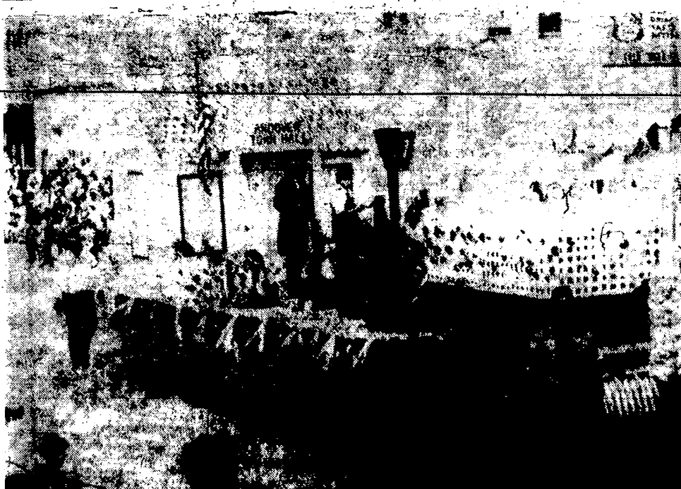
The Town Squires and their Belles in the two pictures above, with their beautiful 3-piece float that won First Prize in the "Historical" Category. The float was so long and huge on the truck and (low-boy) that it took 2 pictures to make sure that the "Town Hall" was included. News Photo