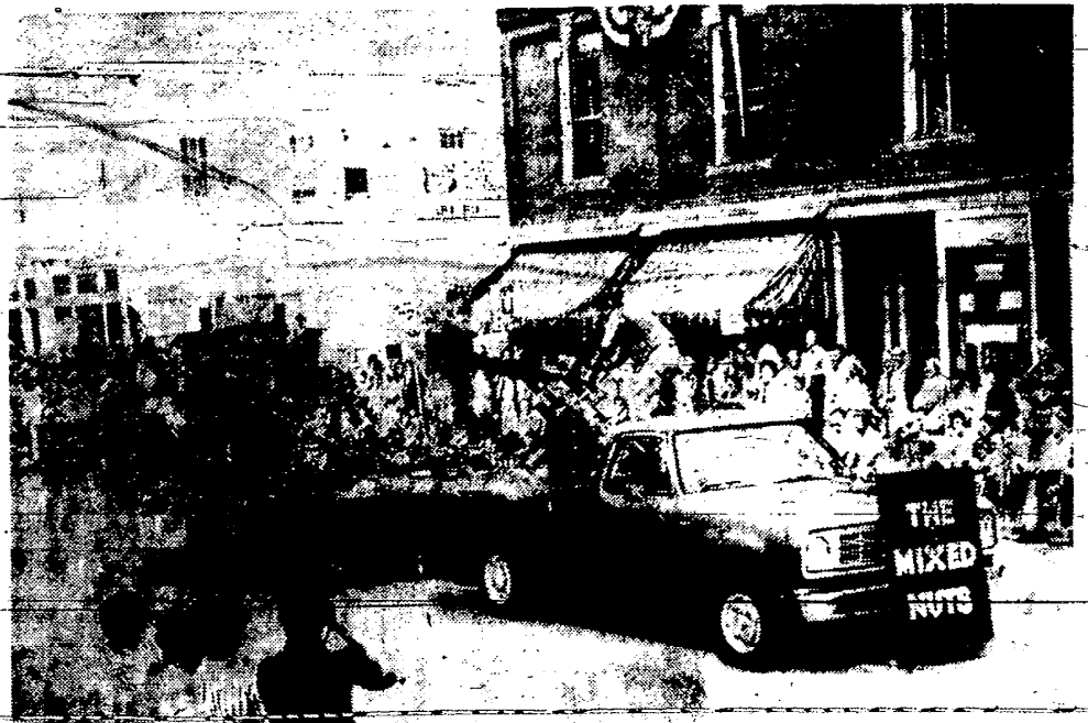
The Mixed Nuts Float that won the 3rd Place Trophy in the Class for Originality.

The Desperado Debs Baton and Drum Corps of Hornell, congratulates Andover on its Sesqui-Centennial Celebration and is pleased to be a part of Saturday's festivities. This summer the Desperados have represented the Southern Tier Area in numerous festivals throughout New York and Pennsylvania and have recently returned from the National and World Baton and Drum Corps Competition at the University of Notre Dame in South Bend, Indiana. During this week of rigid competition known as (America's Youth On Parade) The Debs Junior Group placed fifth and the Juvenile Group placed third in parade corps competition. Due to vacation time for the Debs performing Saturday was only a partial representation of the National competition group and a showing of only a small segment of the