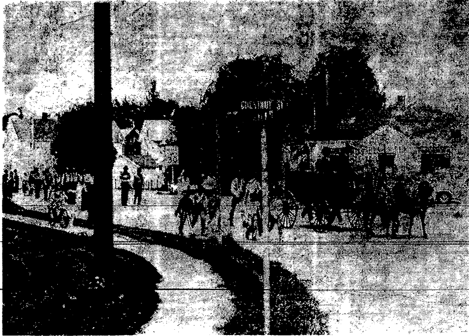
The Funeral Procession for the burial of (John Q Razor) and (Ma y Cosmetic) which marked the official beginning of the Brothers-Brush nears the road junction of Route 21 and Route 17 on the way to Valley Brook Cemetery on Saturday afternoon, June 1 1974. News Photo