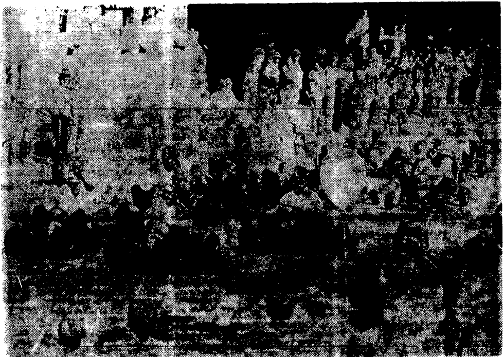
The Cattaraugus County "Kart Korps" of Shriners belonging to "Ismailia Shrine" of Buffalo, line up as they pass the reviewing stand on the 4th of July.

REMEMBER THOSE YOU LOVED WITH A MEMORIAL GIFT TO THE AMERICAN CANCER SOCIETY