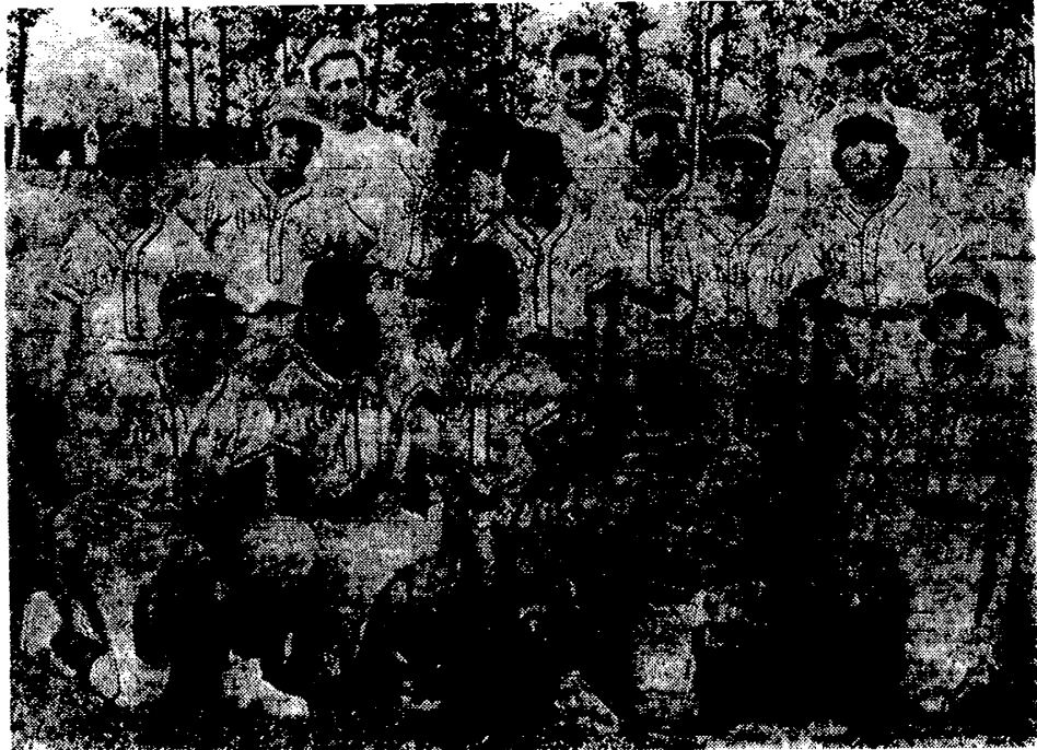
The Arkport Team won their first play-off game against Belmont but lost to Addison in the semi-finals. (No names available at press time.)