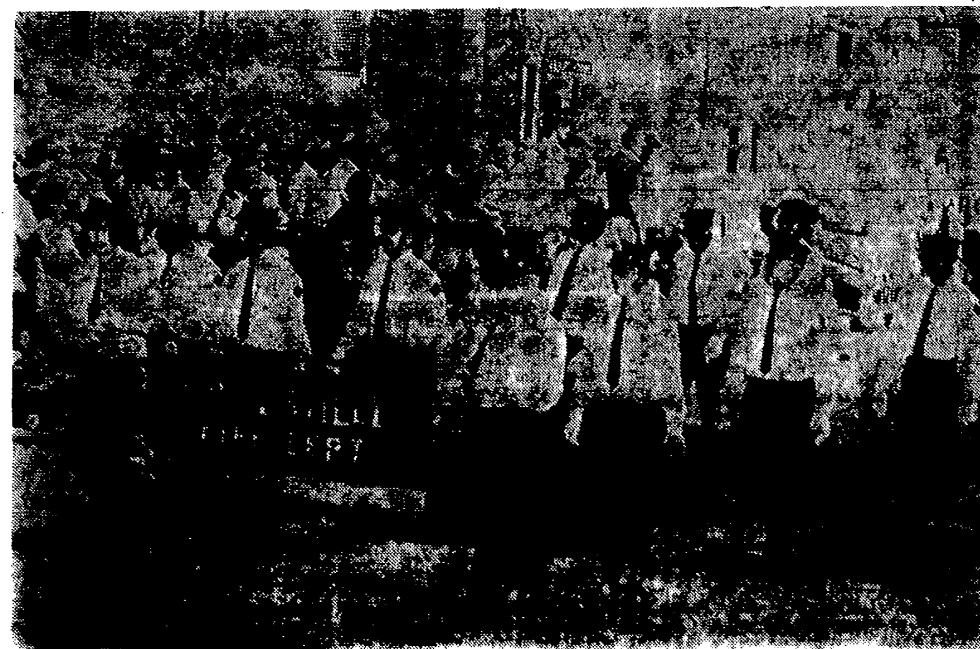
The Whitesville Fire Department do an "eyes right" past the reviewing stand on Main St., and come up with the 3rd Prize in the Firemen's marching unit section in the Andover Fourth of July Parade.