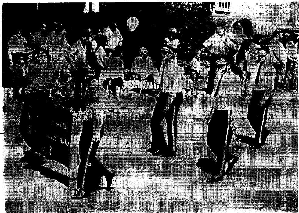
The leading members of the Greenwood Volunteer Fire Co. marching unit that took 2nd Place in the Andover Fourth of July Parade.