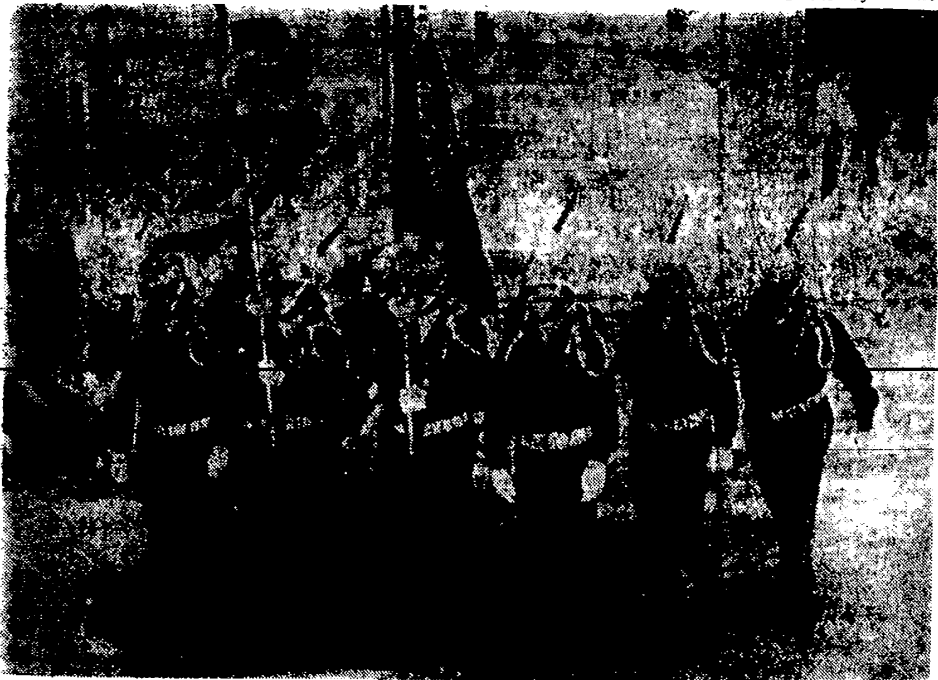
The Canisteo American Legion Color Guard that won 1st Prize in the Color Guard competition at the Fourth of July Celebration.