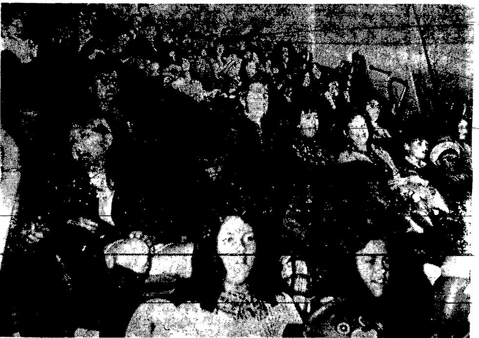
Some of the ACS Students as well as one of the bus drivers and several of the adult Supervisors are "stacked up" to the ceiling in the Buffalo War Memorial Auditorium at the Shrine Circus. Despite the "lofty perch", there were very few empty seats in the group as almost all of the audience stayed "glued to their seats" during the entire performance. News Photo