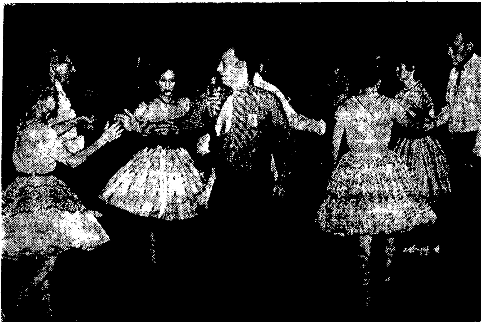
One of the "Colorful Sets" of the "Round & Squares" are caught in action during their demonstration of "Western Style" Square Dancing in the ACS Gym Saturday evening.