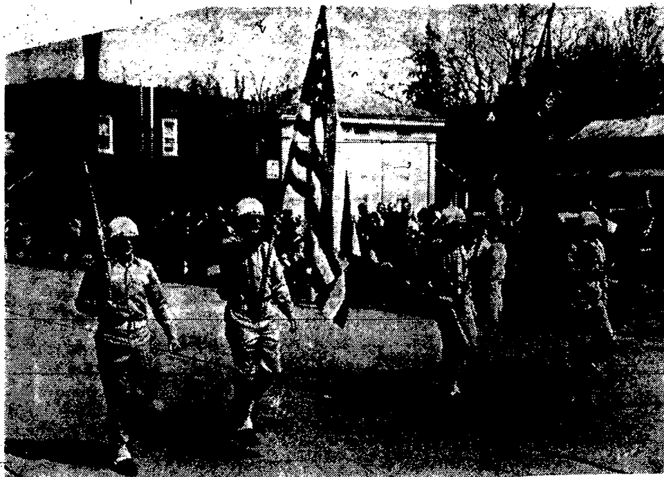
The Andover American Legion Color Guard of Lynch-Burger Post No. 397 lead the 1973 Maple Festival Parade