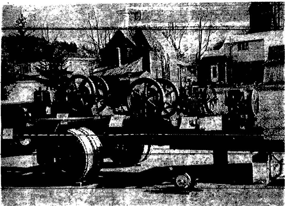
Several of the Antique Gas Engines that were on display in the ACS parking lot during the 2 day Maple Festival. After the picture was taken they were "off-loaded", set up, and were soon "fired-up" and running.