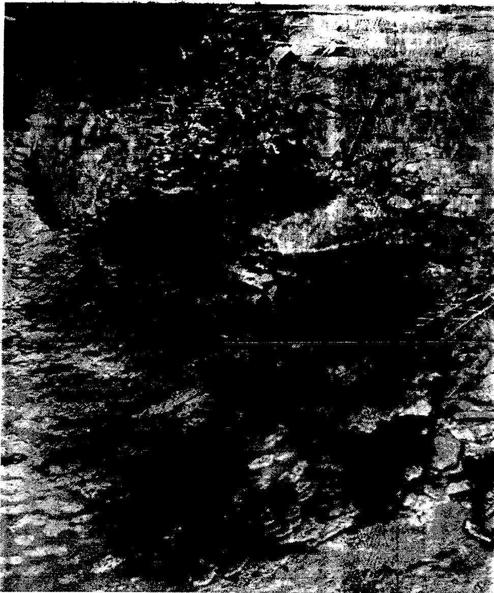
The arrows pointing to a dead mother coon lying in the Quigg Hollow Stream is mute testimony of what oil pollution can do to mother nature's off-spring in a spring-fed stream. News Photo