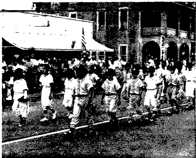
Members of Andover Little League Baseball Team, dressed in their uniforms, march in the Annual Fourth of July Celebration.

Commercial Printing at The News Printing House.