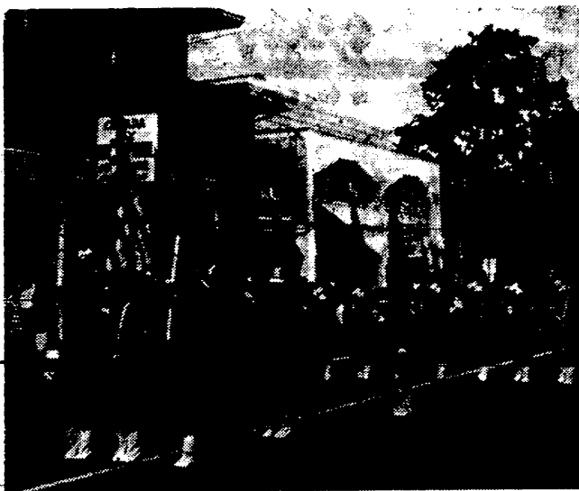
T. "Blue Devils" winners of 1st Prize for "Drum and Bugle Corps" competition "step off at a lively pace" to the "snappy cadence" of their "Blue Devils" march.

VOL. 102, NO. 29 Andover, N. Y. Thursday, July 16, 1970 Published Weekly by The News Printing House, Andover, N. Y. $3.00 year, 10c copy