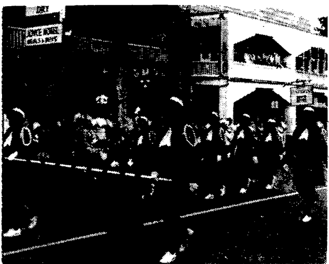
The Wellsville Firemen's Auxiliary, winner of the First Prize in that division, "Strut Their Stuff" as they parade down Main St., in Andover's Annual 4th of July Celebration.