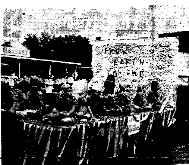
Brownie Troop 219 takes Third Prize in the Annual Fourth of July Parade.

treatment. Hospital charges to patients for transfusions are usually covered by Blue Cross or other hospital insurance plans.