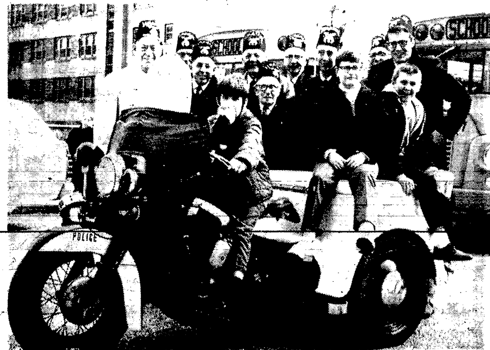
The first two Andover students that returned to their Bus after visiting the Buffalo Zoo were rewarded by being allowed to sit on one of the Police Escort's Motorcycle, with most of the Allegany County Shriners present gathered in back of them.