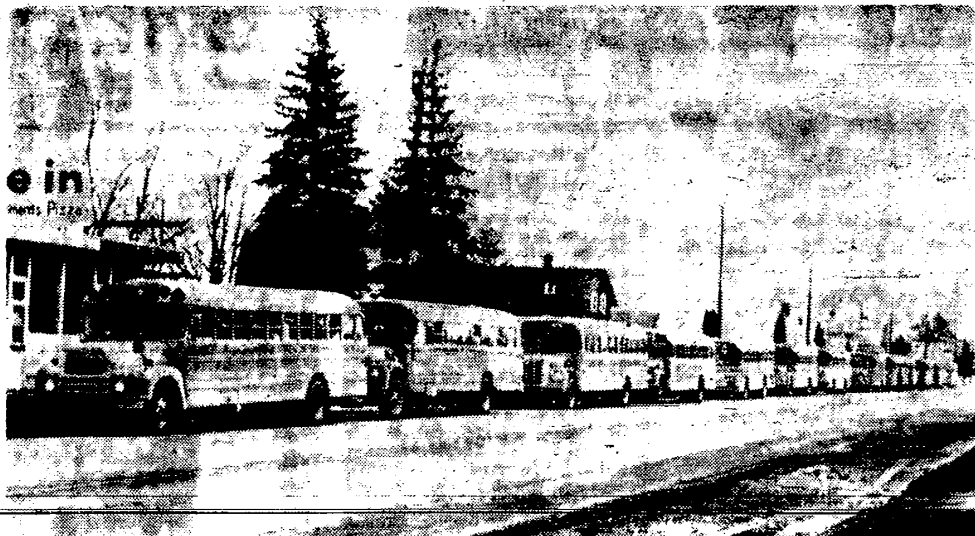
17 School Buses from Allegany County line up at Yorkshire Corners in "Shrine Circus Caravan". This was made possible thru the fine co-operation of the 13 School Boards in the County and the Shriners that were hosts to the 800 County School Children. News Photo