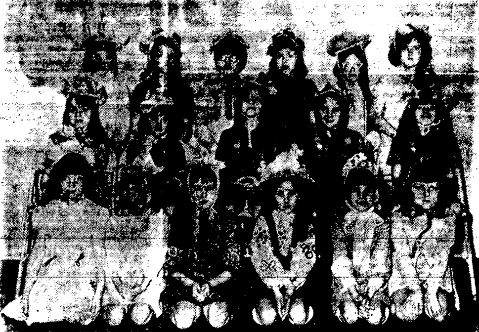
Members of Brownie Troop No. 233 with their "Home-Maid" Easter Bonnets that the girls made themselves for their meeting held Thursday at the Masonic Hall.