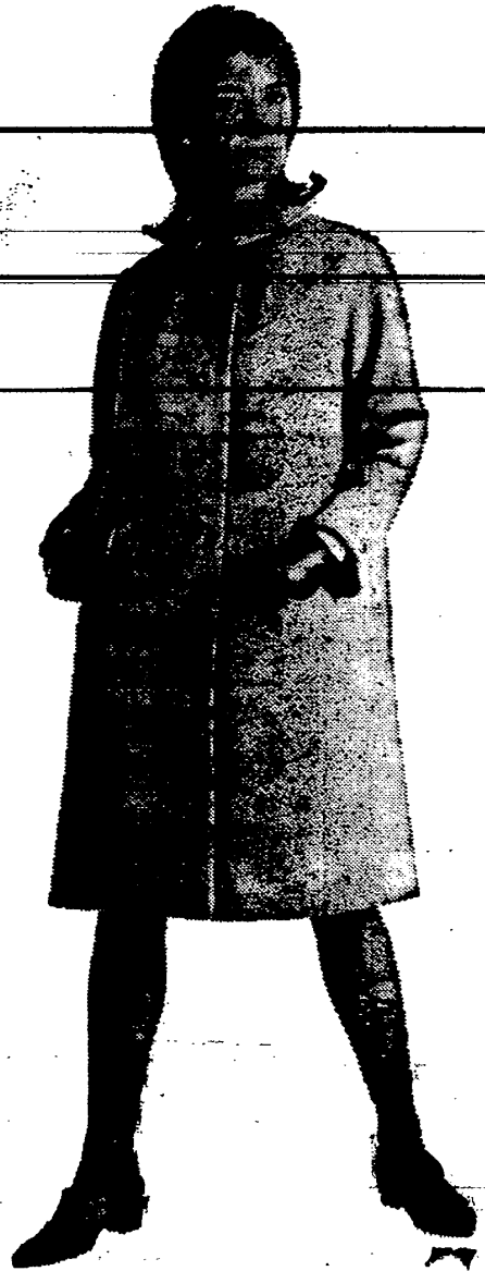
LASSIE BALMAGAN. Every size looks "at home" in this superb casual, Eton lines. Convertible collar, tab buttoned cuffs, raglan shoulder. In CARAVELLE, a 100% wool.