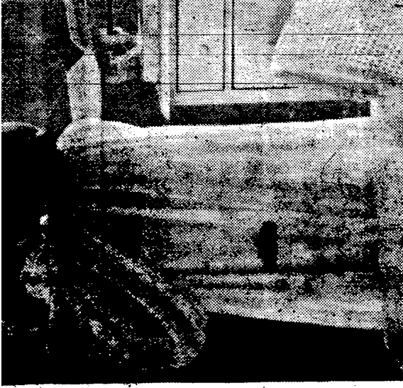
...cuddle a baby. Stork-wise Top Value Stamps let baby eat, sleep, play—without budget pains.