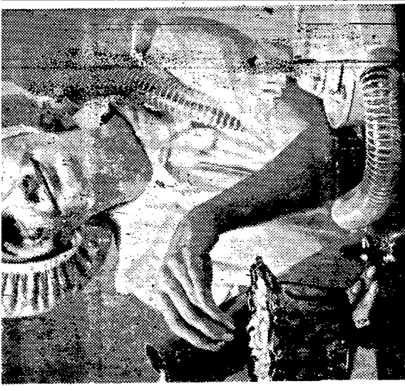
...do something special for you! Hair-dryer or whatever, Top Value says, "You deserve it."