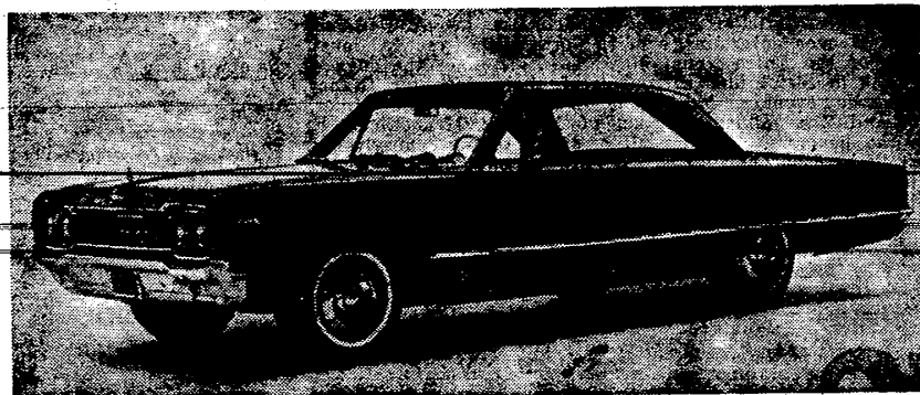
ALL NEW DODGE POLARA. The two-door hardtop, one of six luxurious models in the Polara Line on a 121-inch wheelbase for 1965.