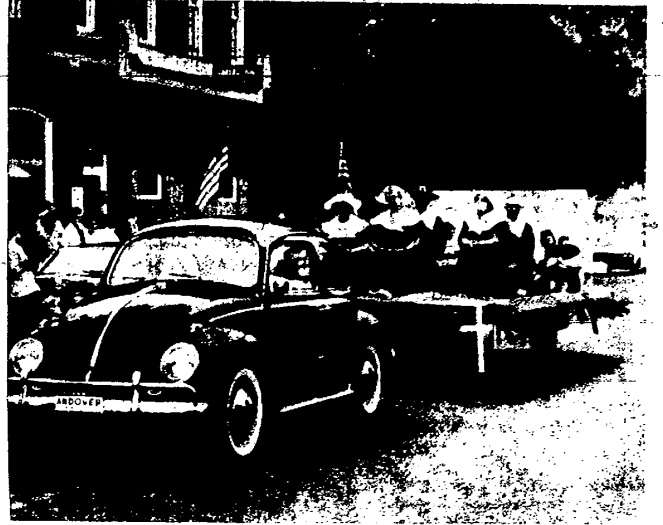
The Baptist Church Float, "Pilgrims at Prayer", winner of the Second Prize.

make this year's "Birth of Freedom" Celebration such a huge success and hope that everyone will get together next year for an even bigger and greater show.