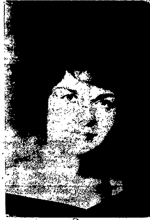
Graduated June 3rd