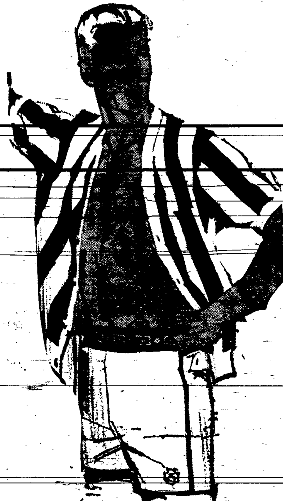
Jantzen's famous classic "Harpoon" trunk

Hits the target: Hawaiian length, web waist, and all.