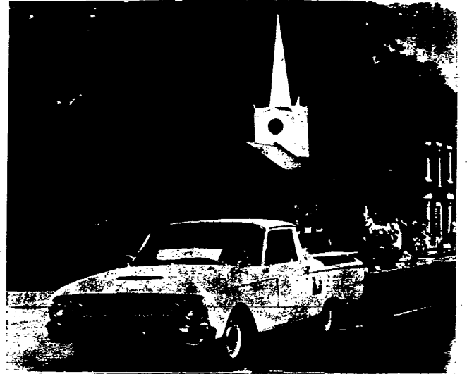
The Methodist Church Float in the 4th of July Parade