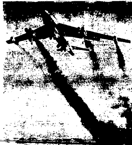
Jet B-47 in flight on SAC mission.