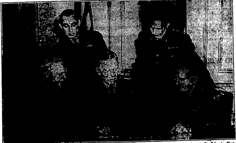
CHIEF OFFICERS OF THE WAR DEPARTMENT STAFF—Left to right (seated) Lieut. Gen. H. H. Arnold, Commanding General, Army Air Forces; Gen. George C. Marshall, Chief of Staff; Lieut. Gen. Leslie McNair, Commanding General, Army Ground Forces; (standing) Maj. Gen. Joseph T. McNarney, Deputy Chief of Staff; Maj. Gen. B. H. Somervell, Commanding General, Services of Supply.