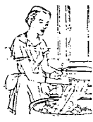
The week's washing done for about 2c with an electric washer!

who lets low cost electricity take over her household