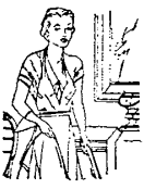
A penny for electricity cleans the house from top to bottom!

Gone are the days when doing all your own work by hand was a sign of thrift. For now the thrifty housewife can let electricity shoulder much of the load at low cost. Your electric bill is an investment in hours of freedom! A few pennies a day will run all the electrical helpers you need. And the more electricity you use, the lower your cost per kilowatt hour.