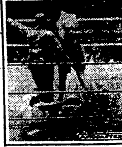
Lower picture shows the veteran Tom Gibbons of St. Paul, down for the count when knocked out in the 12th round by Gene Tunney at N. Y. last week. Tunney (above) says he is now ready for Dempsey.

The people who would buy what you would like to sell—or who would sell what you'd like to buy—are, of course, readers of the classified ads.