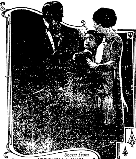
Scenes from 'BROKEN LAWS' with MRS. WALLACE REID

Now is a splendid time to take stock of ourselves and our children. Are we doing right by them? Are we giving them the kind of home