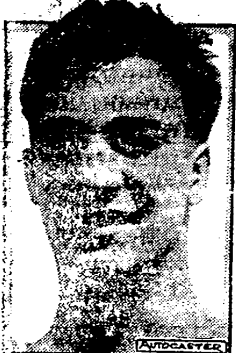
Paul Berlenbach of New York won the light-heavyweight title May 31, by defeating Mike McEgan in 15 rounds.