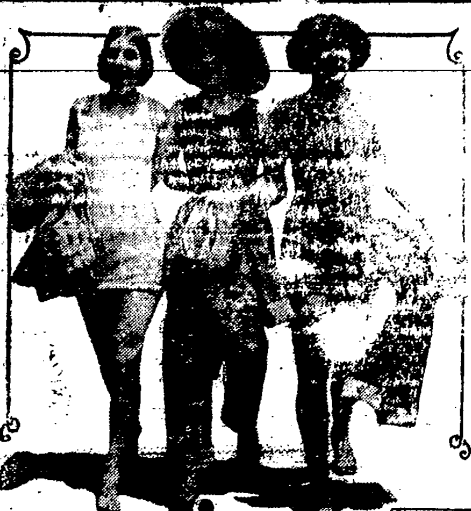
"No more sun-burned noses" is given as the reason for the newest style—which brings forth the beach pajamas.