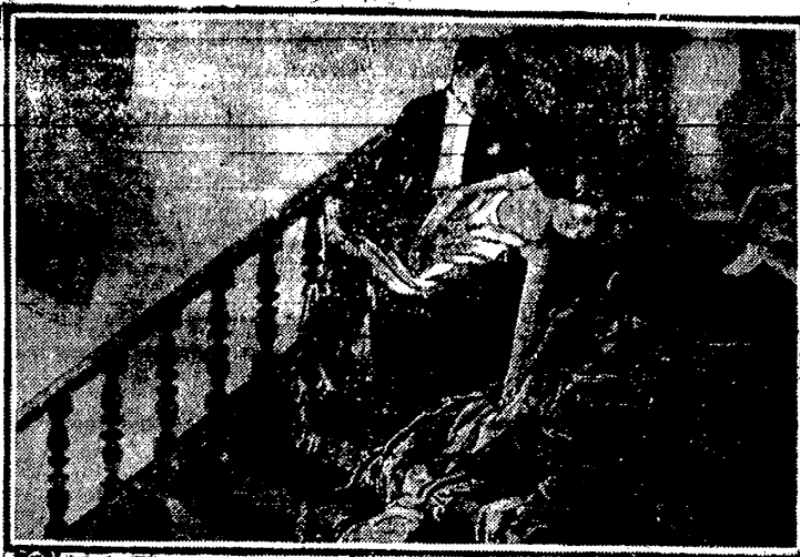
Leatrice Joy and Victor Varconi in a scene from the Paramount Picture "Triumph," A Cecil B DeMille Production