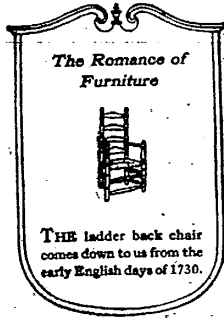
The Romance of Furniture

an ancient motto, and a very good one to have in mind when you select furniture. The quickly chosen bargain often proves poor economy in later years. Furniture, a lifelong possession, should have behind it, for protection, the guarantee of a store of known integrity and reputation.