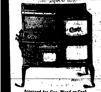
Arranged for Gas, Wood or Coal.

The front of the fire box is so ventilated that it will not warp. Thus positively eliminating any trouble from changing the burners, which formerly might have occurred.